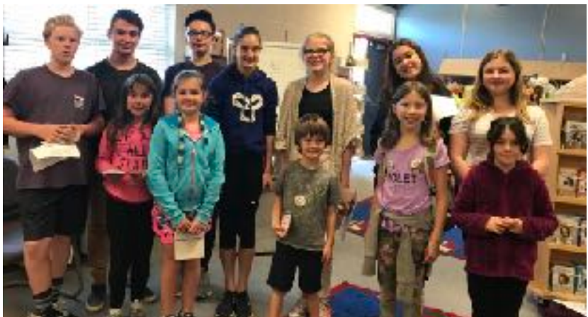
Photo: Students who supported the Lecture en Cadeau program

Each volunteer was given a special CPF “seed” so that they may plant and grow their own tree!